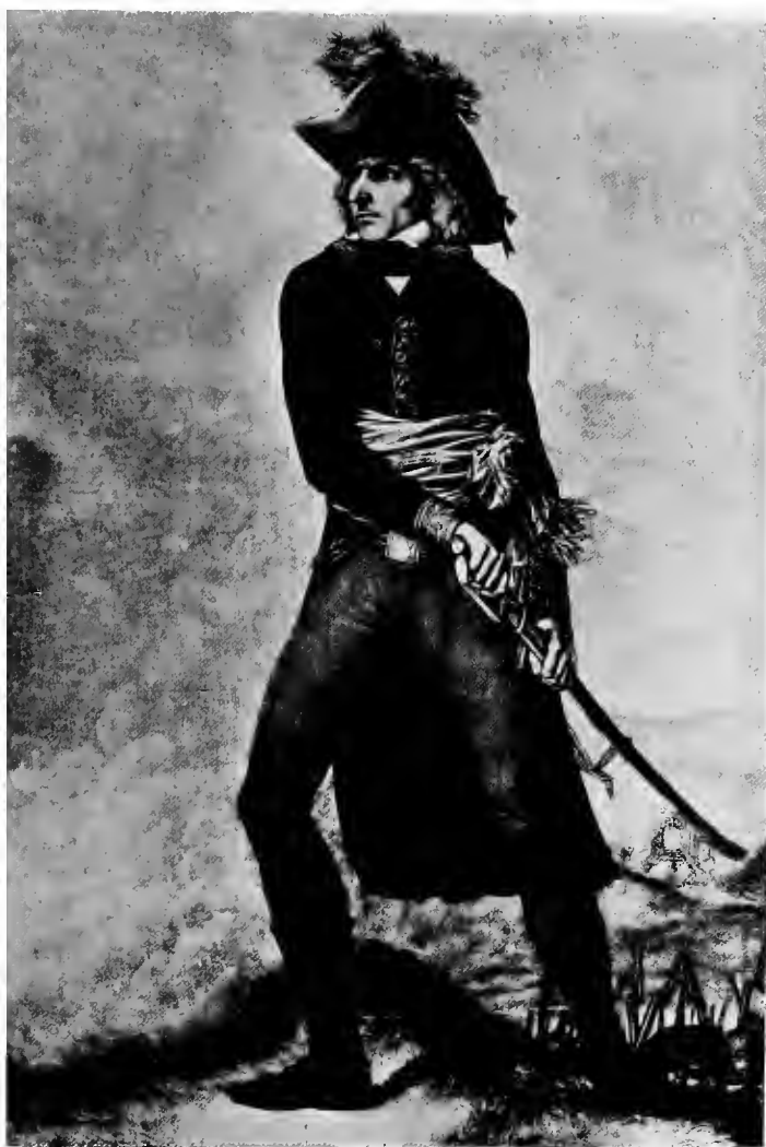
JEAN BAPTISTE BERNADOTTE, KING OF SWEDEN FROM AN ENGRAVING AFTER THE PAINTING BY HILAIRE LE DRU